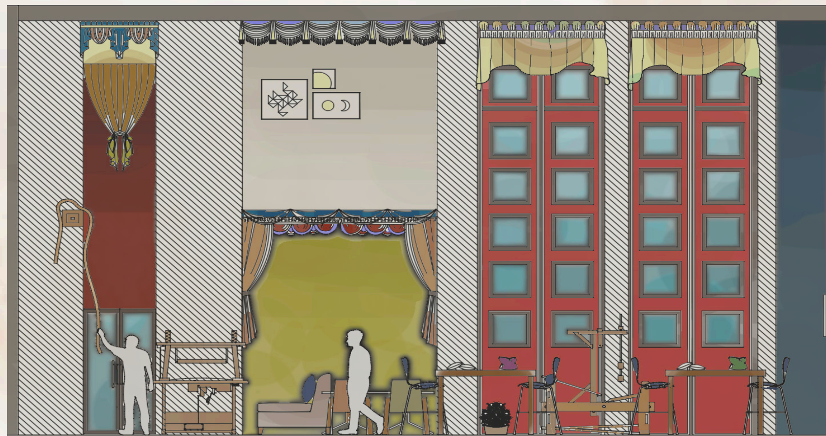
B:B Ground Floor: Workshop space