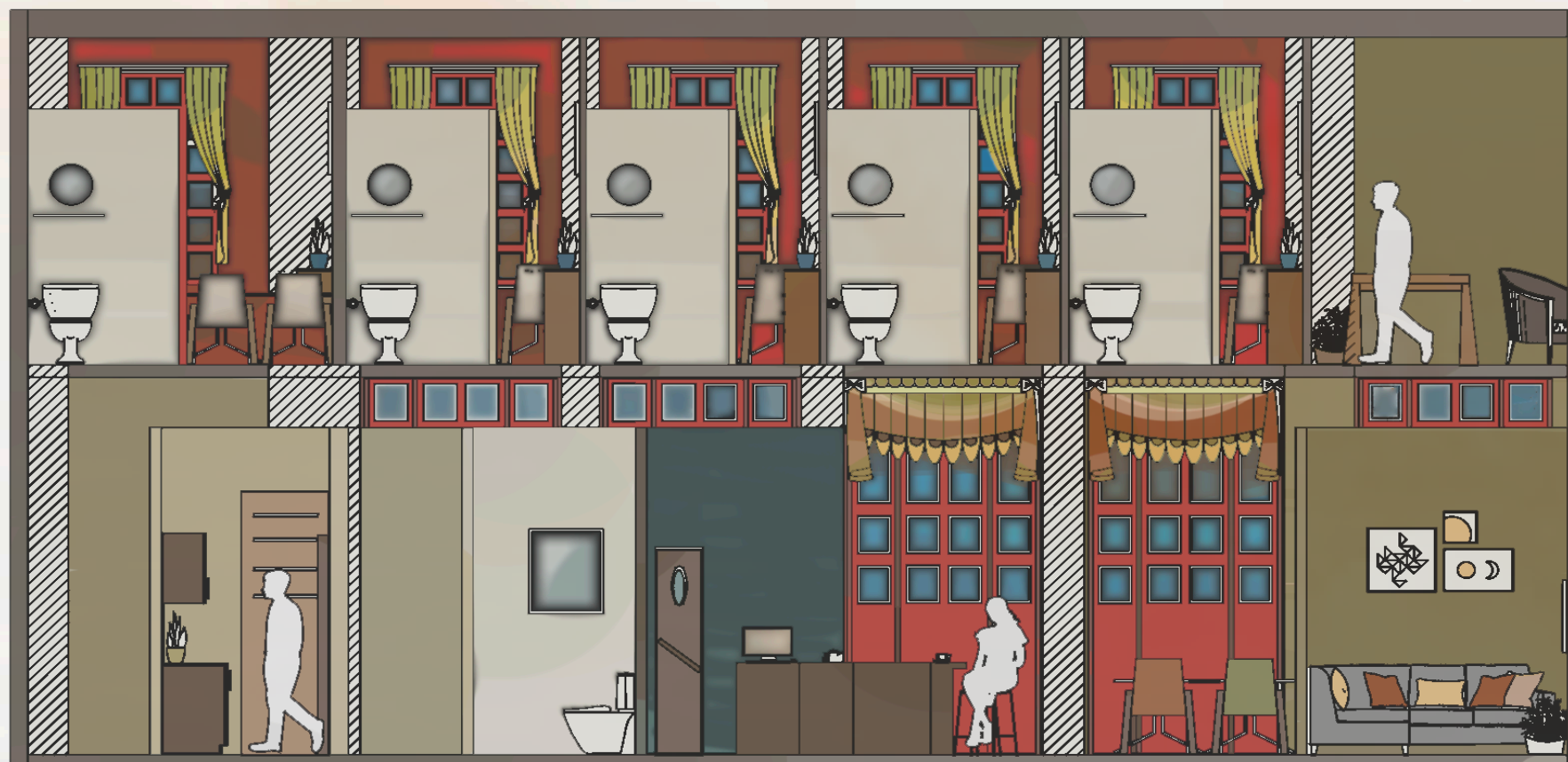
A:A Ground Floor: Workshop space/Cafe First Floor: Apartments/Living Concept

Heritage crafts reflect skilled manual techniques and traditional materials passed down through generations, preserving cultural identity and supporting local economies. These will be sustained through workshops led by short-term resident artists or long-term, fostering knowledge exchange, tourism, and community engagement. Weaving, chosen for its collaborative nature, will take place in an open, social space with extra seating and generous storage for textiles and tools, encouraging creative experimentation and dialogue between makers while meeting practical needs.