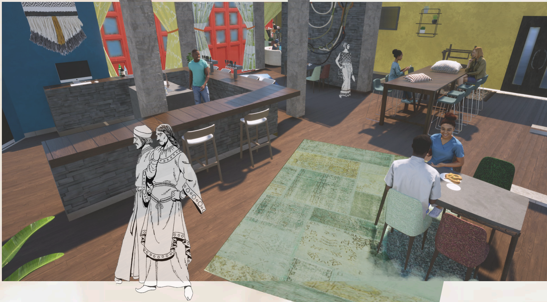
-WorkShop Space for Weaving & Cafe

Workshops will be accessible and affordable, with profits generated through accommodation, shop sales, and rotating residencies. Guest artists will be invited to teach short-term, expanding the offer and encouraging repeat visits. The space also addresses Bristol's need for affordable artist housing, with shared social areas and a collaborative planning room to support a self-sustaining creative community.