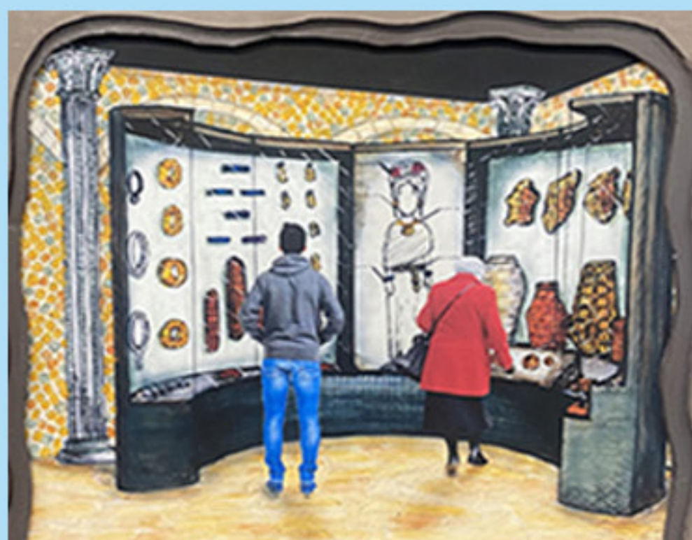
Visitors will go through many exhibitions celebrating the past. This specific one communicates Roman life in Leicester.