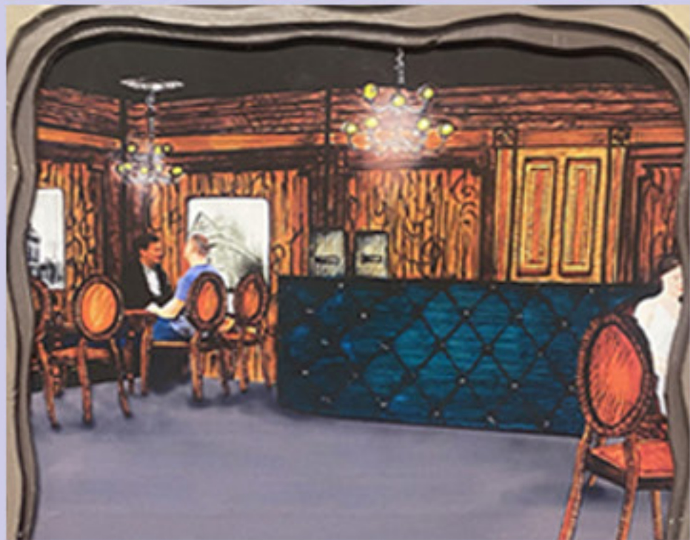
Visitors can sit and relax in the coffee house cafe, allowing them to connect with others and reflect.