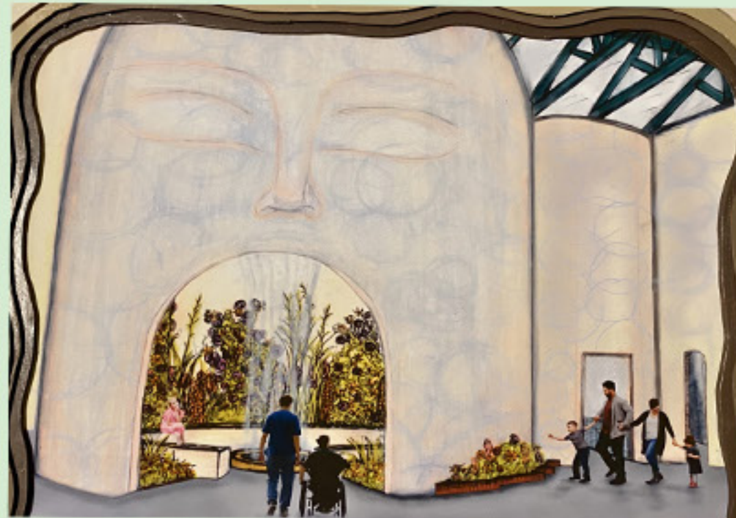
Visitors will enter the final zone, the future. Here they can imagine their own future through VR or sit and contemplate what they could bring to Leicester's story.