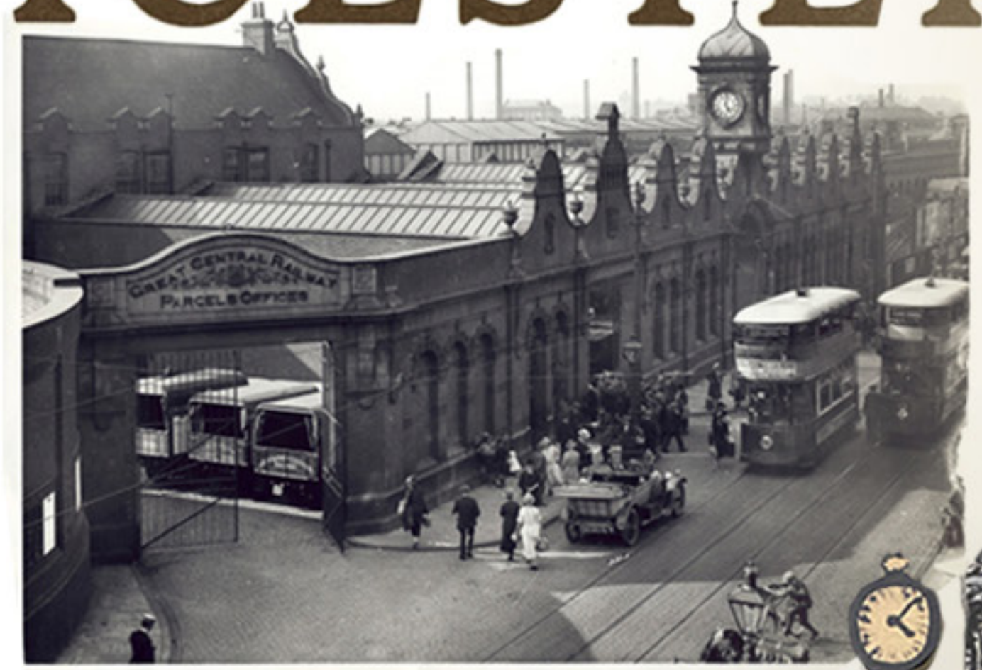
Location: Old Grand Central Railway Station Leicester, LE3 5DJ

Visitors can explore Leicester's rich past within the old station, only by uncovering layers of its history can we truly inspire and shape the future.