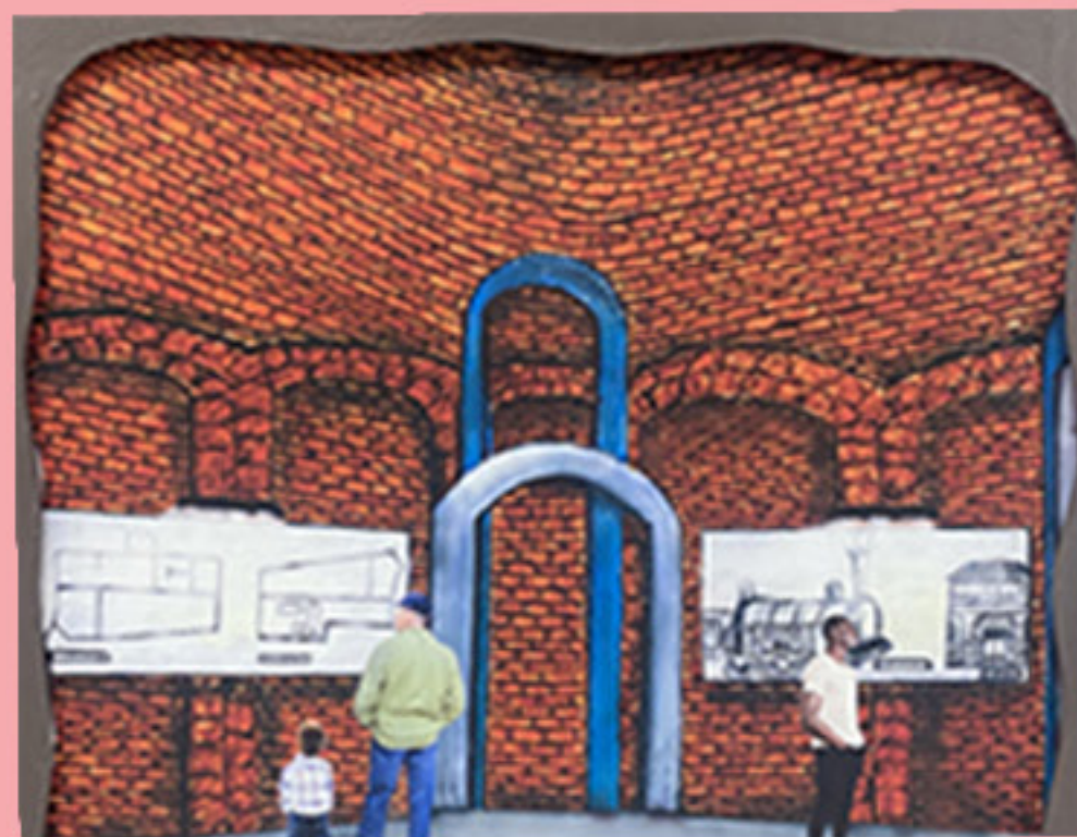
Visitors will enter an introduction space where they will be told the quest. The locations's history will also be present.