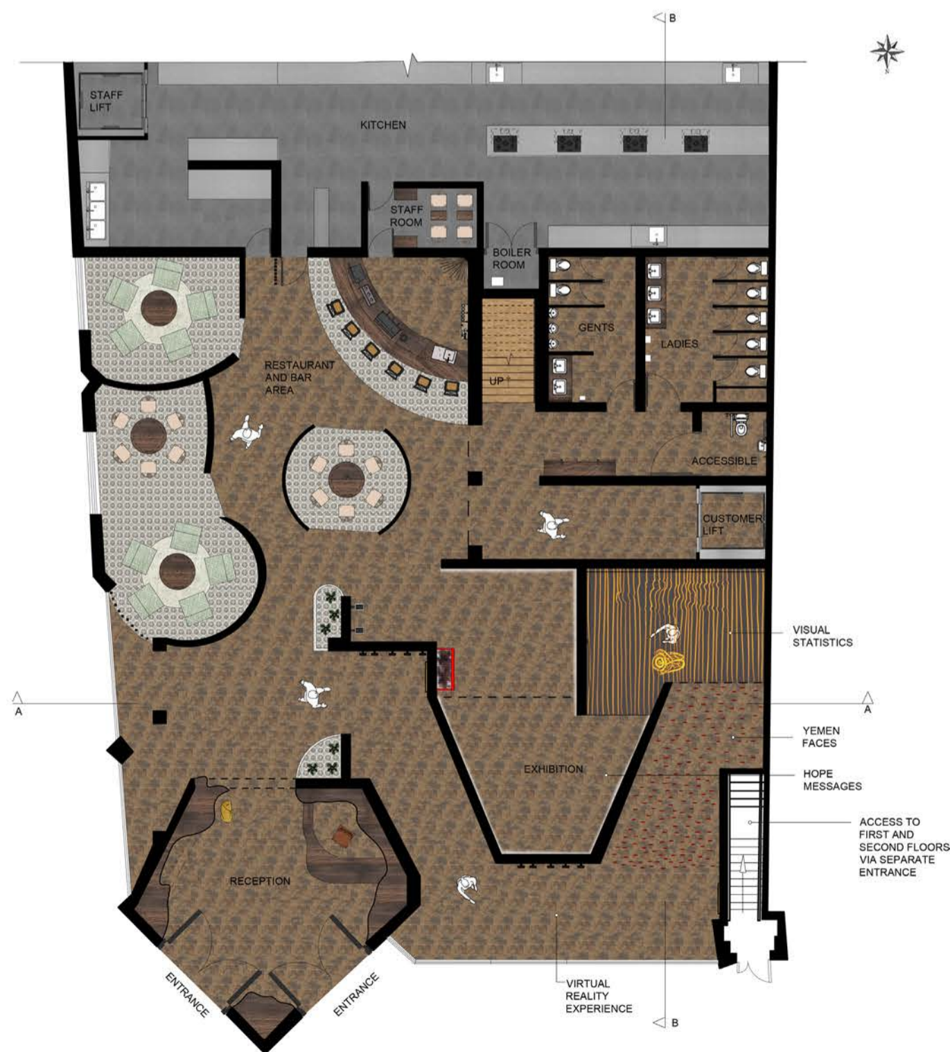
GROUND FLOOR PLAN 1:100 @A1