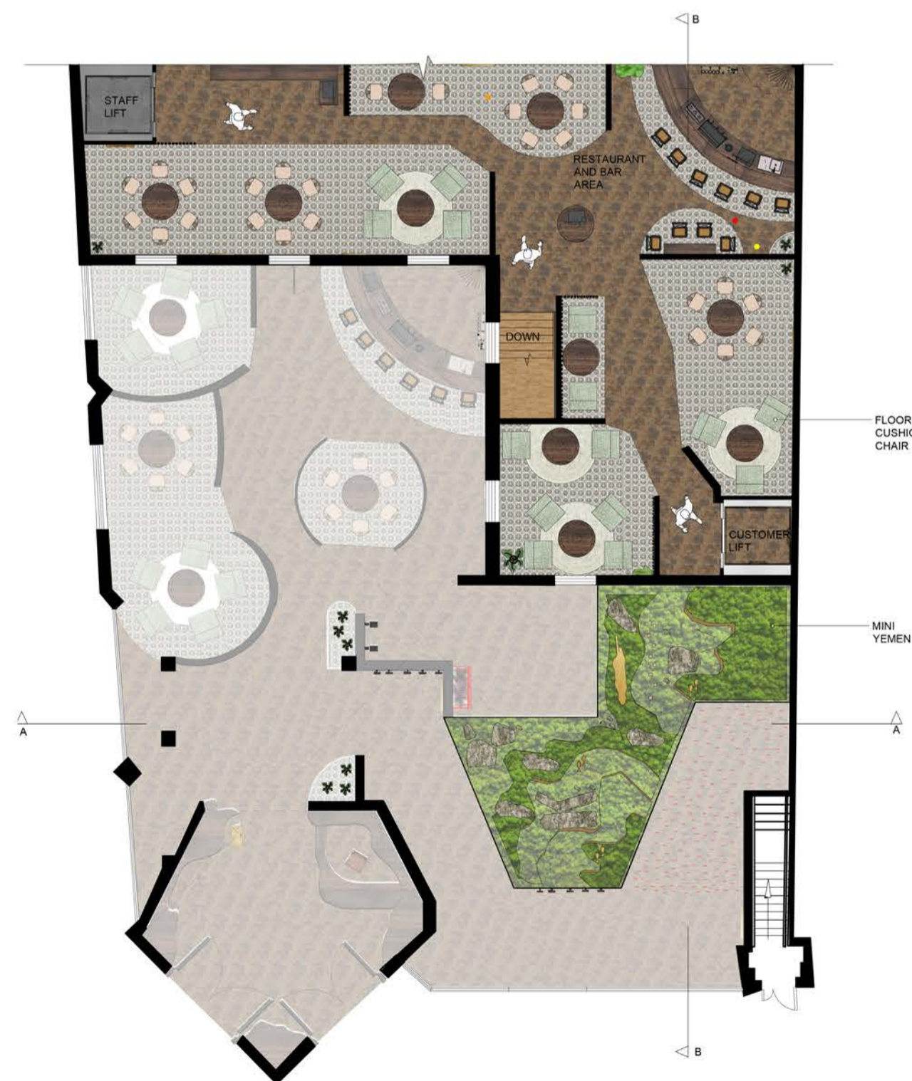
MEZZANINE FLOOR PLAN 1:100 @A1