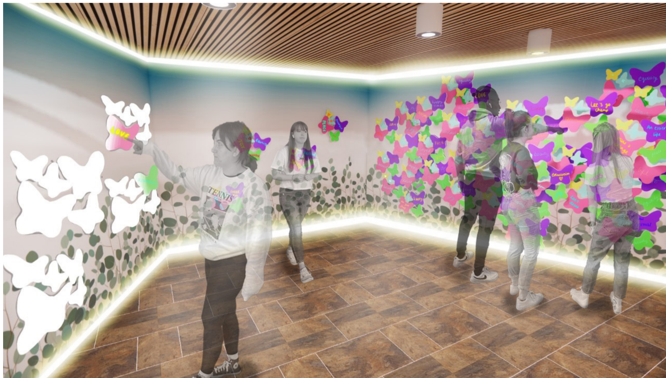
Butterfly Hope Tunnel