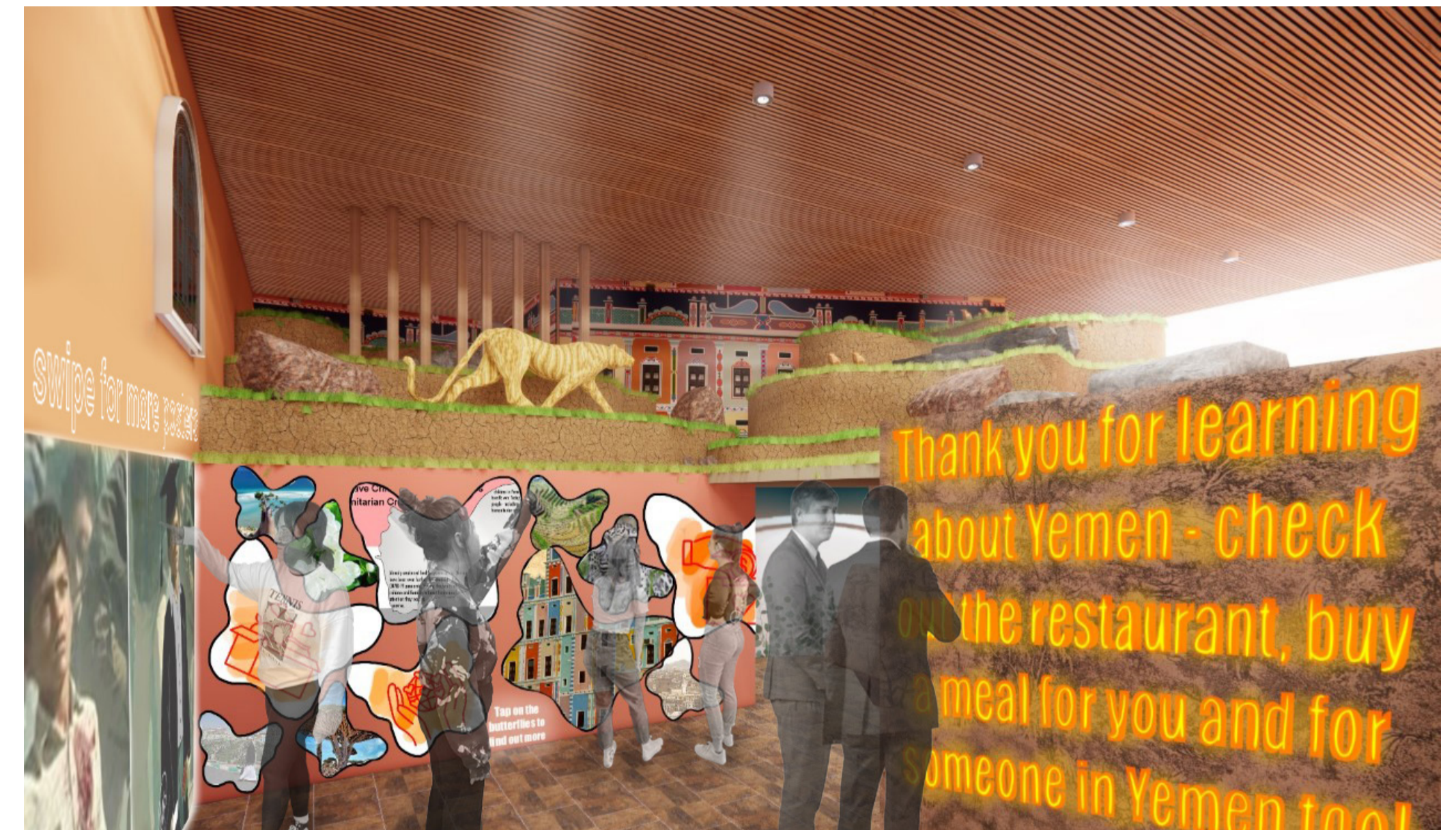
End of Exhibition and Mini Yemen