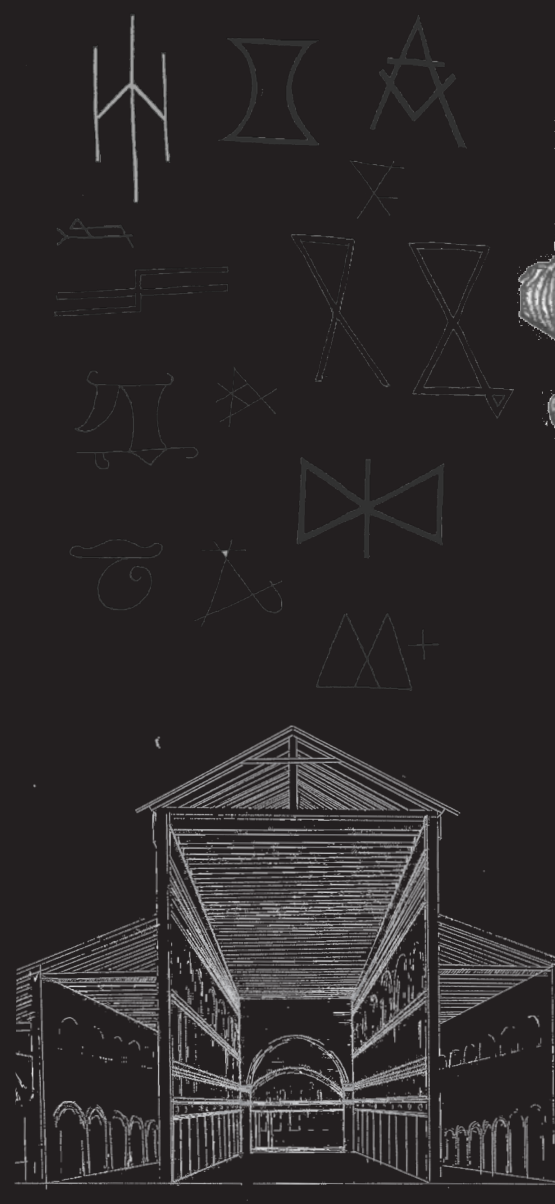
Below: A study of Mason's marks found on churches and cathedrals