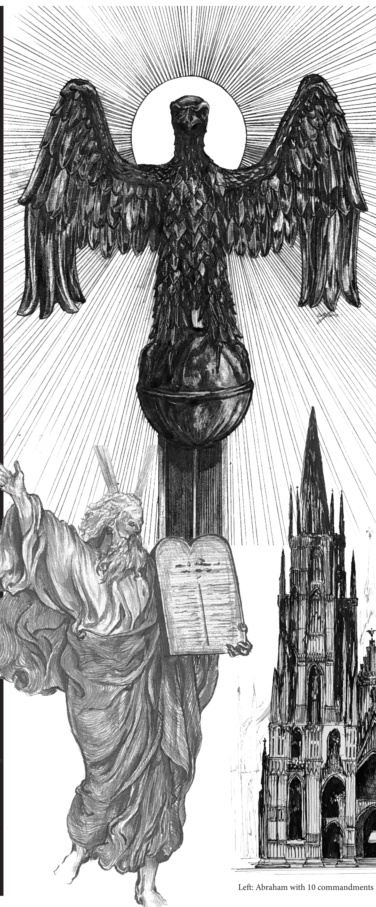
Left: Abraham with 10 commandments