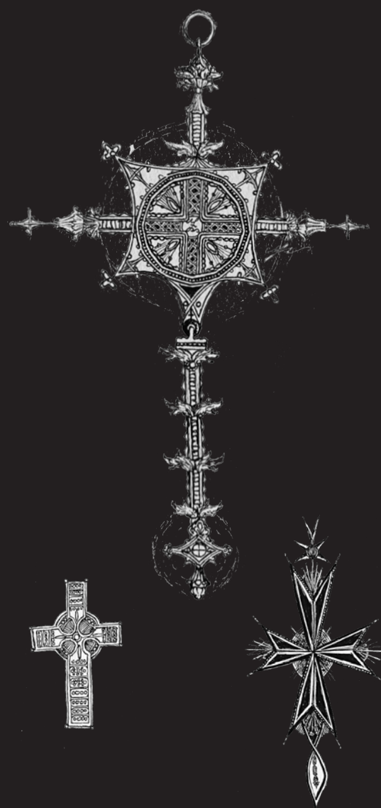
Above: Cross drawings, practising Gothic intricacy.

"The highest achievement of art is to elevate man. But that of course, presumes there is something higher than man to elevate him to."