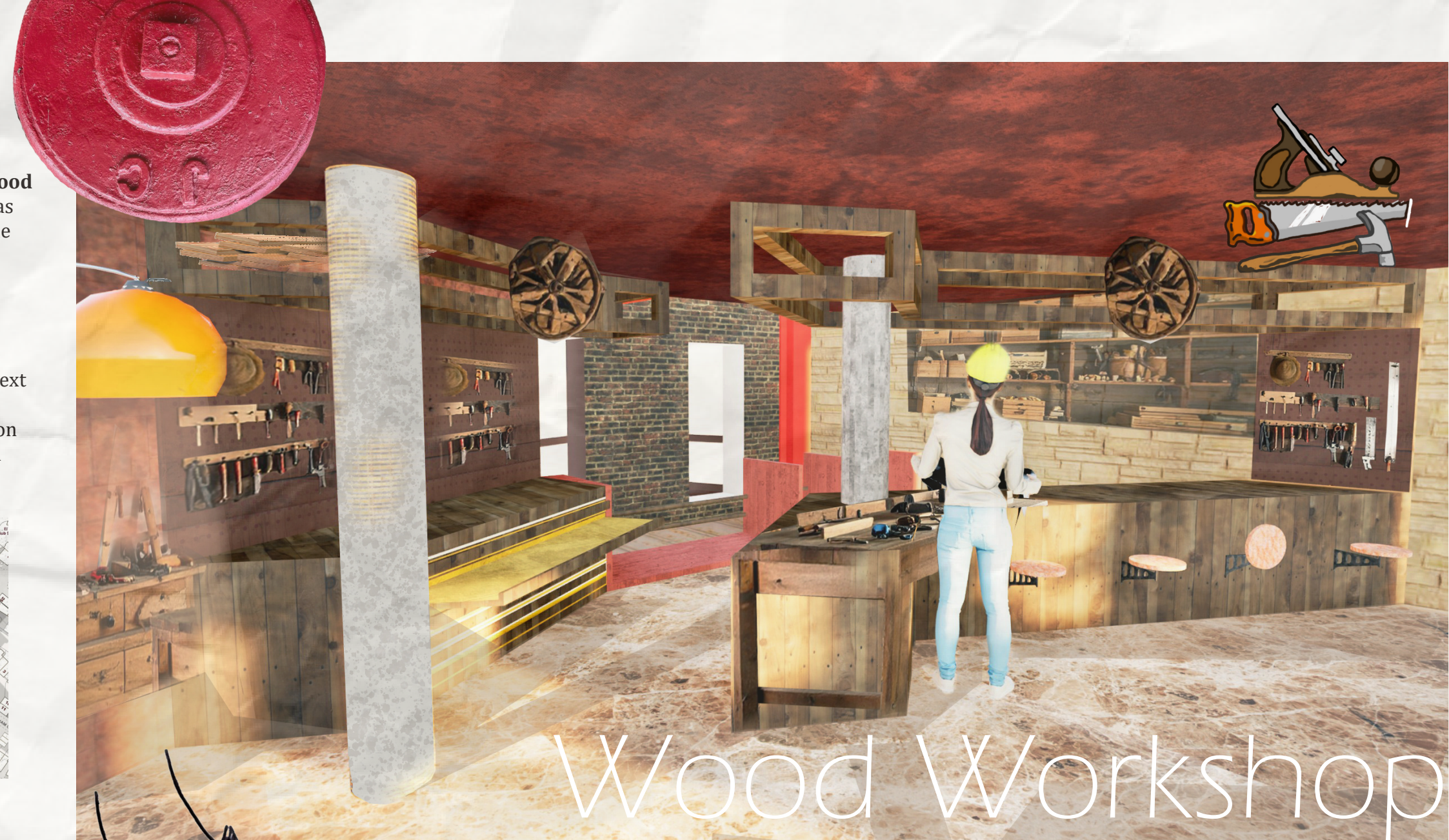
Wood Working Workshop - Ground Floor

The Ground Floor is home to the wood working workshop, where students will be able to work with the medium using both machine and hand tools to build their projects. The aim of this workshop is to build confidence in young people as well as gain a skill which could help them in their future providing them with life knowledge.