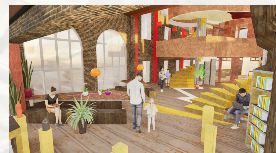
Twinmotion Visuals Ground Floor