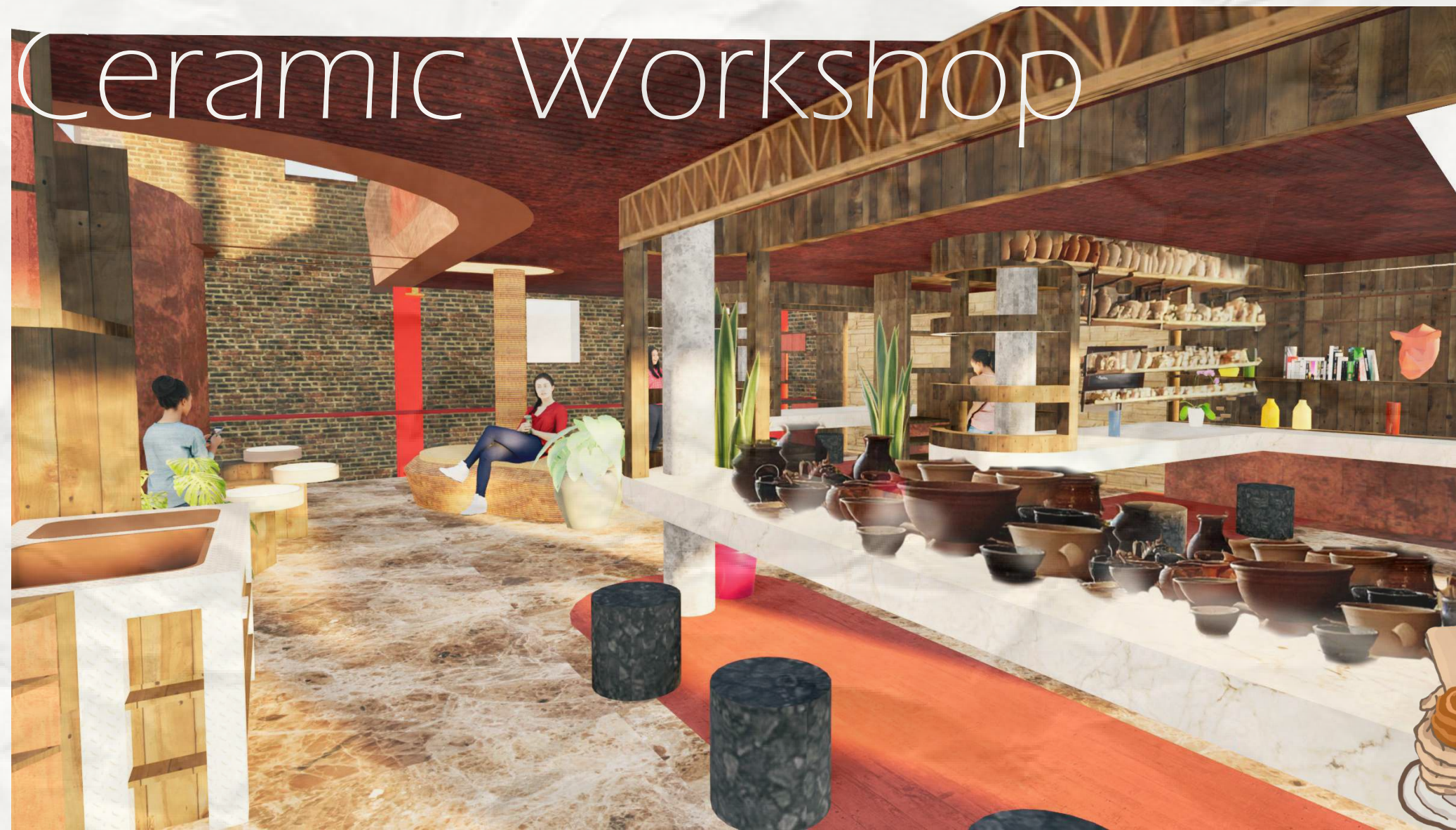
Pottery and Ceramics Workshop - First Floor