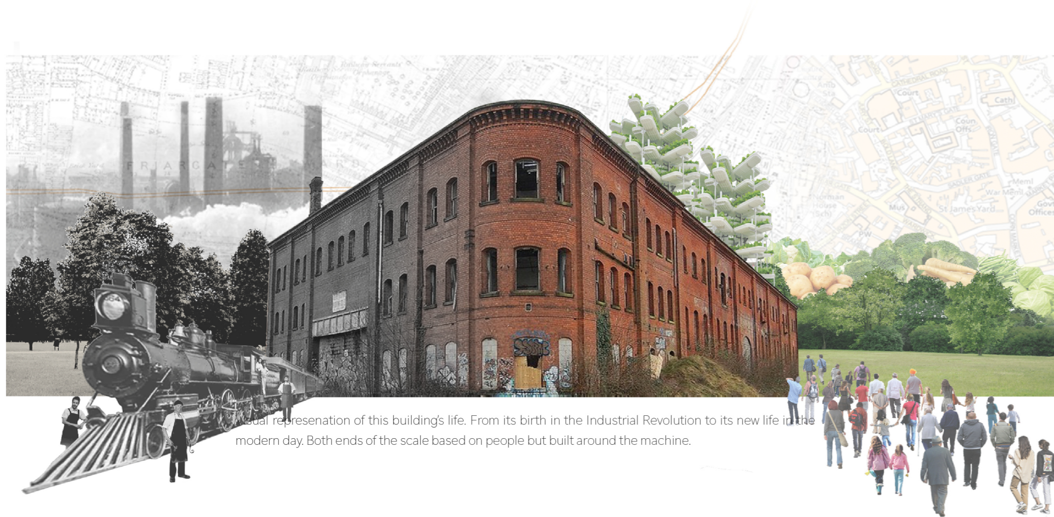
Visual representation of this building's life. From its birth in the Industrial Revolution to its new life in the modern day. Both ends of the scale based on people but built around the machine.

Having to find a building that accommodated a solution to a problem in this world, led this project to The Bonded Warehouse, Derby. This building came with its own problems, however the main problem was found within the surrounding area of the building.