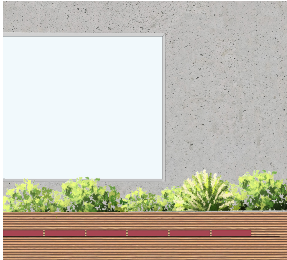
Social Seating Elevation, scale 1:50