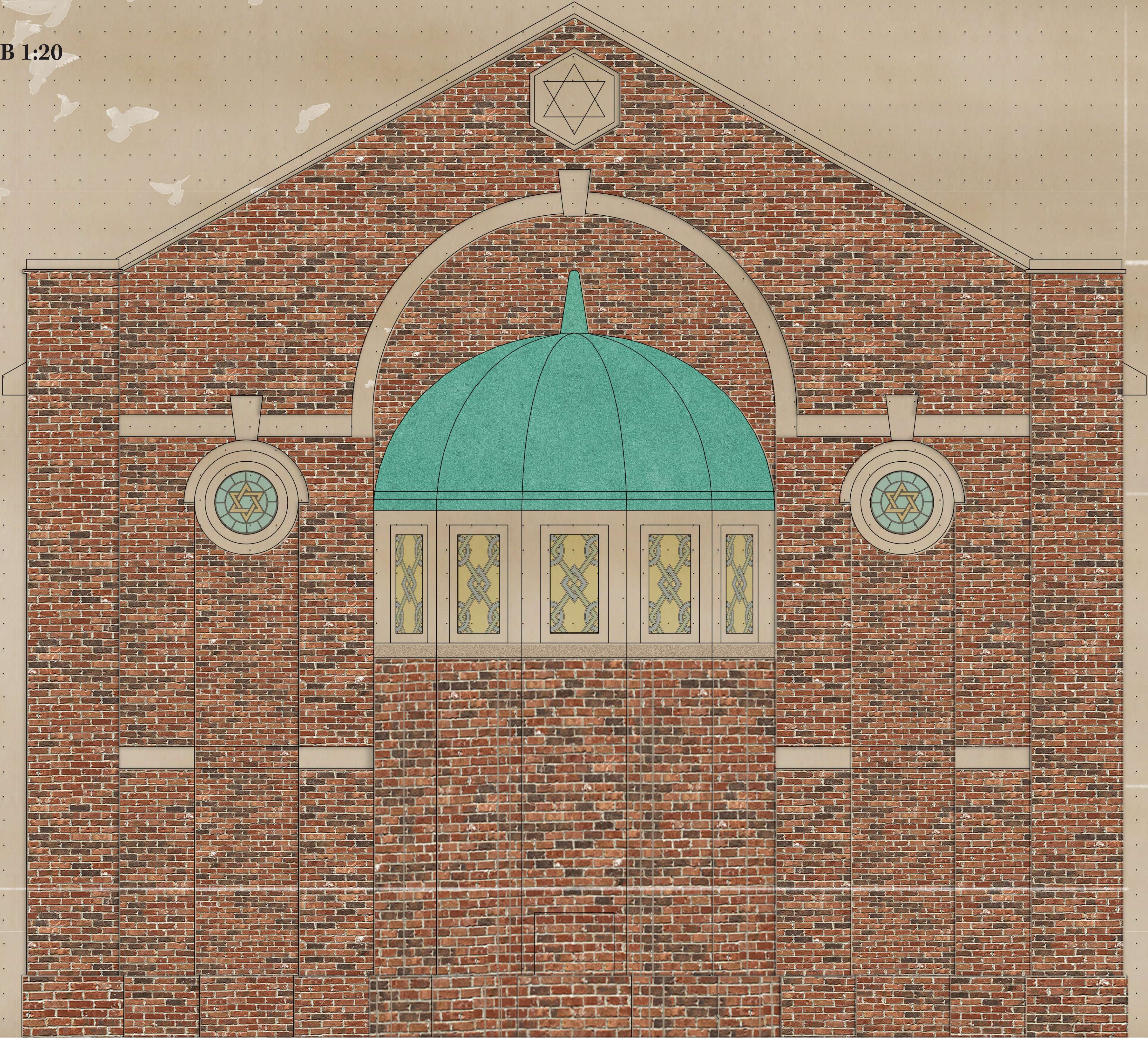
ELEVATION B 1:20