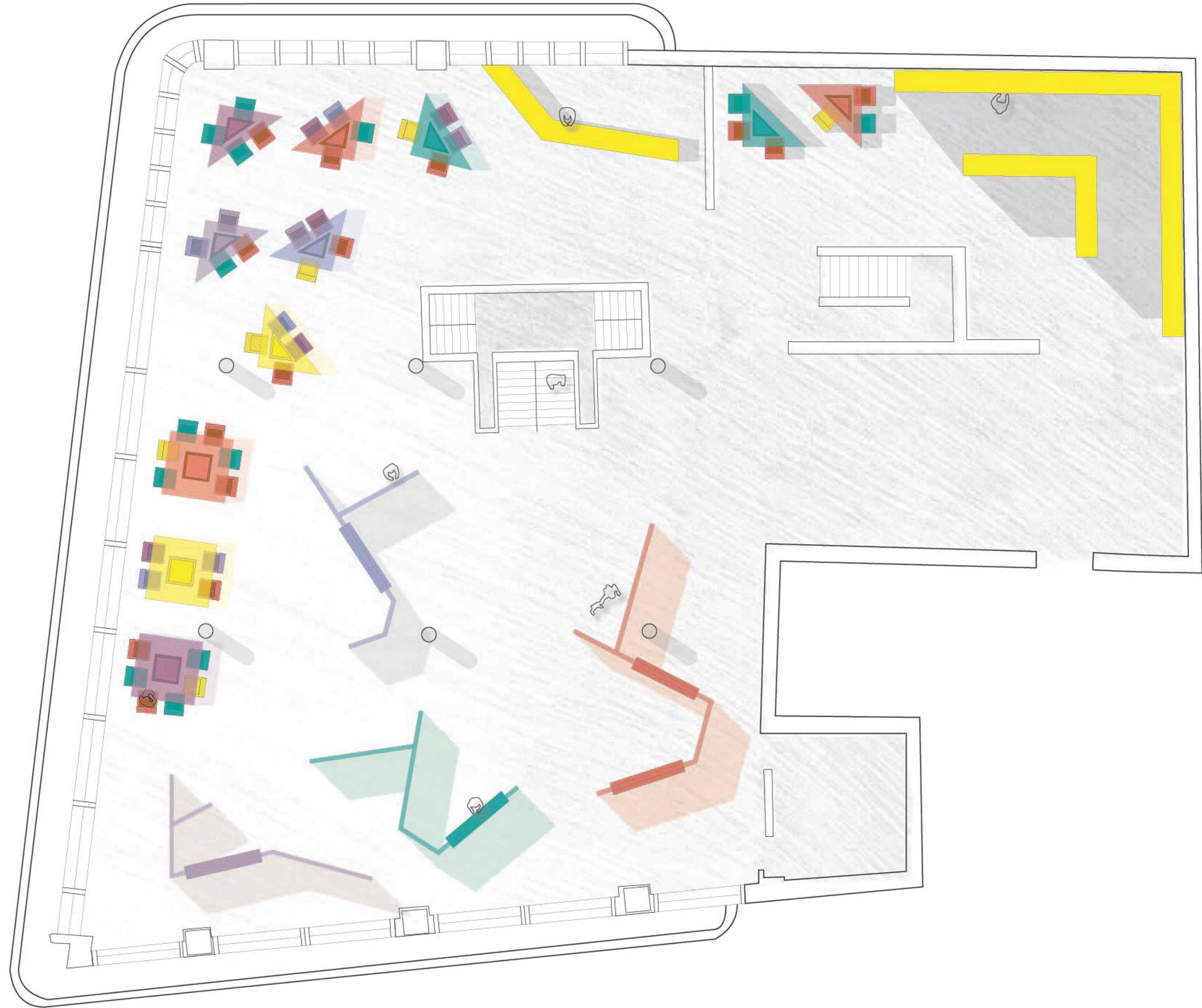
1st Floor Plan Scale 1:100