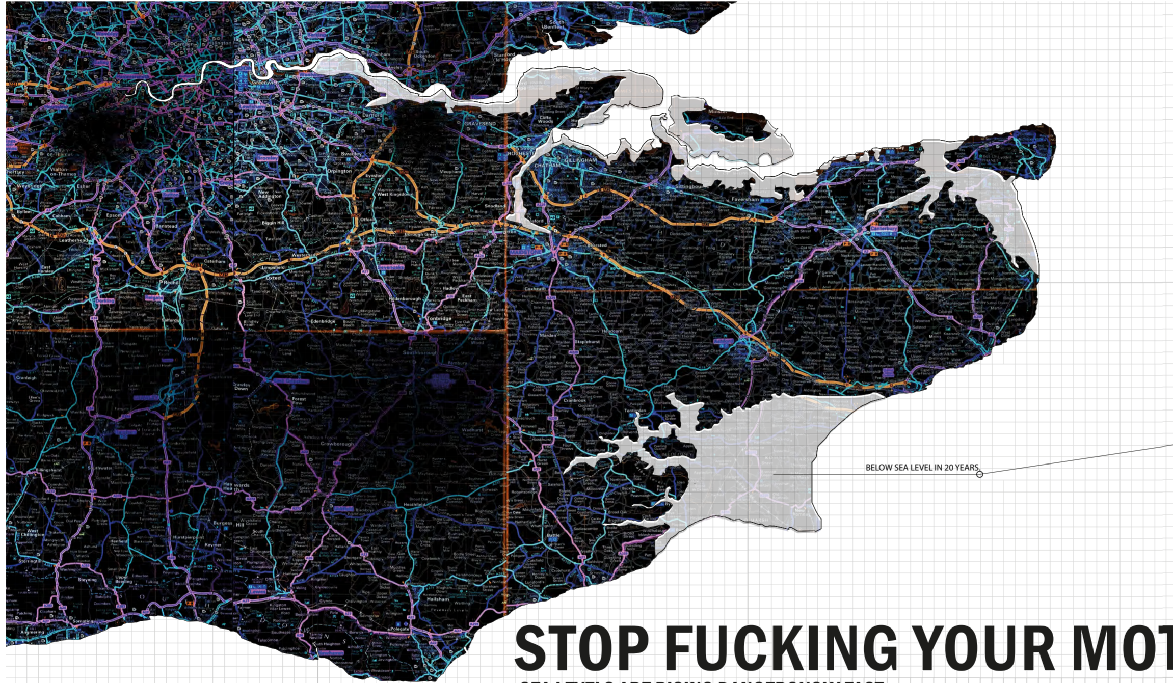
BELOW SEA LEVEL IN 20 YEARS