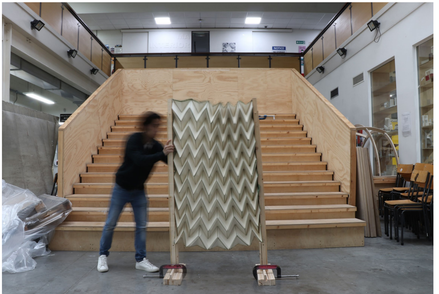
1:1 FOLDING SCREEN PROTOTYPE

THE EXAMPLE OF THE FOLDING SCREEN IS TO REINTERPRET THE MEANING OF VICTORIAN FOLDING SCREEN, I HAVE COMBINE ORIGAMI TECHNIQUE DESIGN A SCREEN CAN BE FOLD AND COMPACT IN A SMALL URBAN APARTMENT.